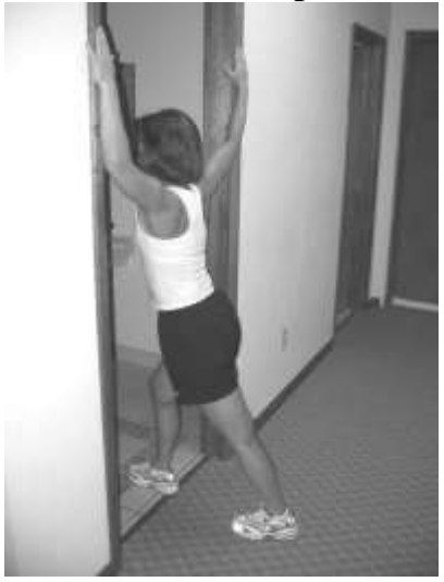
Repeat the above sequence for another 60 seconds Repeat these two stretches three times each day.

Move the hands up the door frame one foot higher.